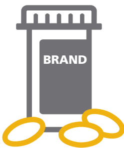
Brand Lipitor Active ingredient: atorvastatin

A generic medication contains the same active ingredient(s) as a brand-name medication. An active ingredient is what makes the medication work. For example, Liptor® and its generic both contain atorvastatin, which reduces the amount of bad cholesterol in the blood. Brand-name medications are often protected by a patent. When the patent ends, drug companies can apply to the U.S. Food and Drug Administration (FDA) to begin making generic versions of the medication.