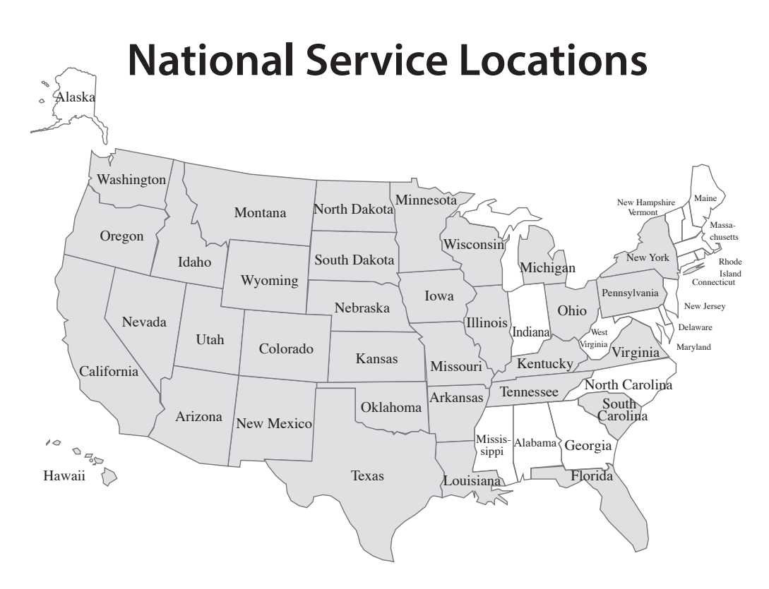
Shaded states represent EAP service locations.

We contract with affiliate providers in areas outside of our local and satellite areas. We have satellite clinics in Hettinger, Harvey, Rolla, Fort Yates, Minot, Dickinson, Prairie Knights Casino and Hazen.